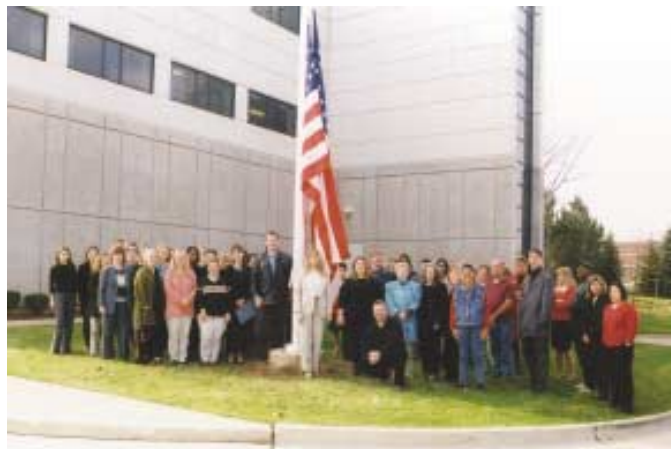
Fig. 2: ACI staff members gathered together around the new flag pole